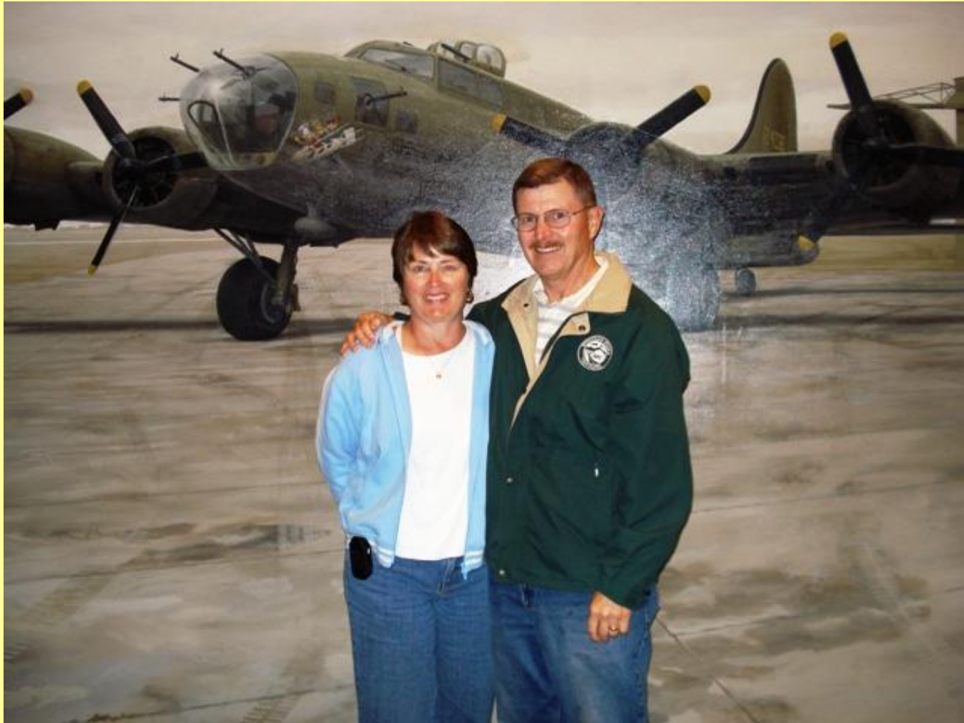
The Eighth Air Force Museum near Savannah, GA