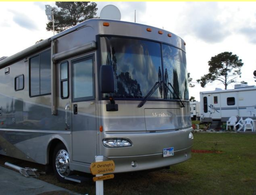
Our Winter Home – NO snow