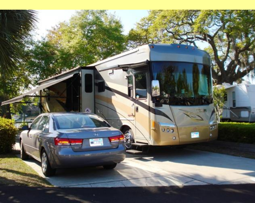
Front of our site