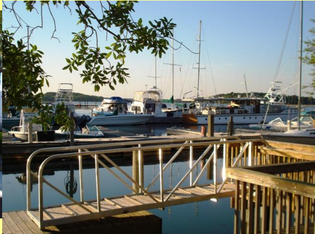
The Back yard of our site