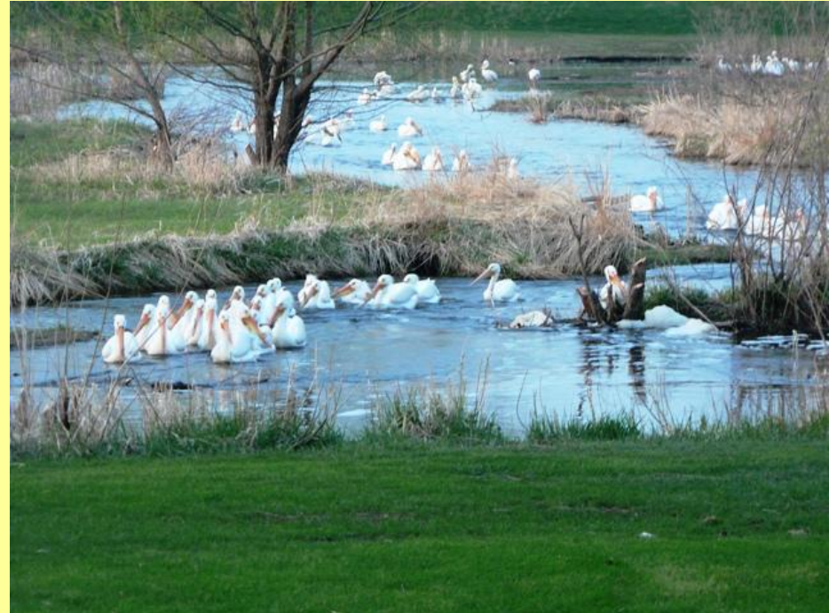
Pelicans fishing in the creek – May, 2008