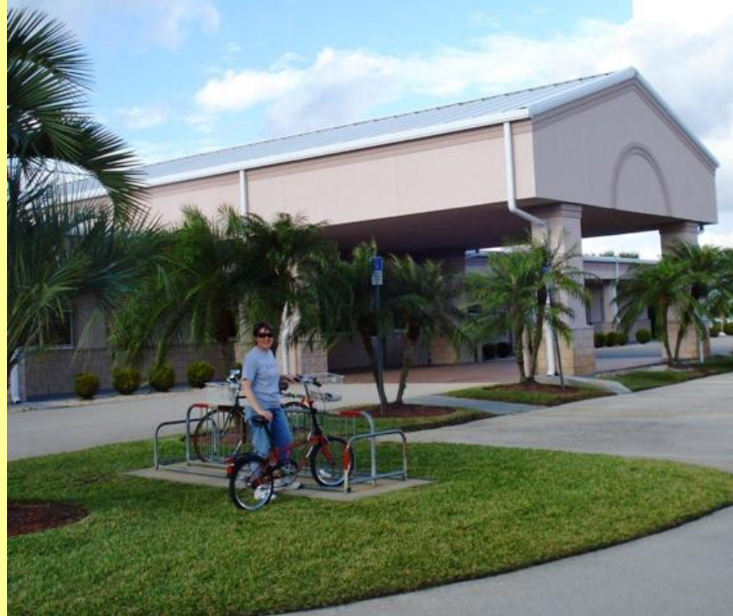
The Clubhouse in our park