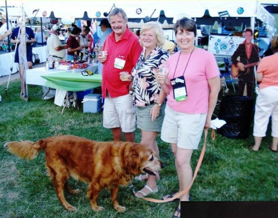
Friends from Alberta