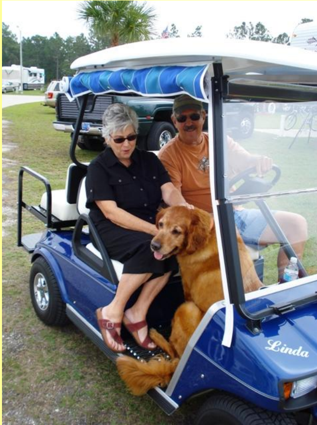
Our dog, Cody getting a ride