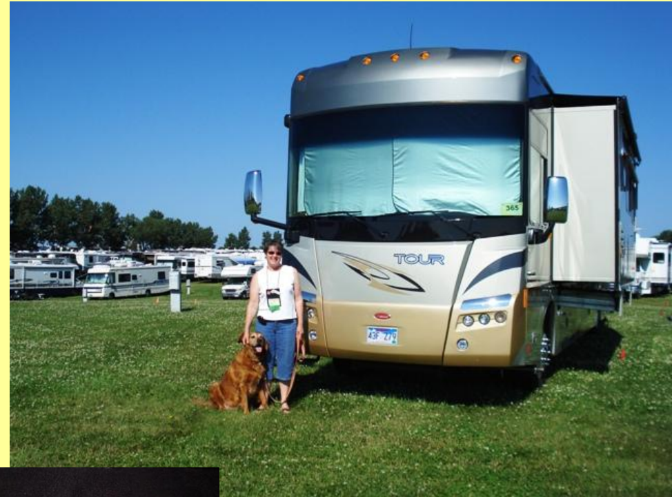
Our spot in Forest City