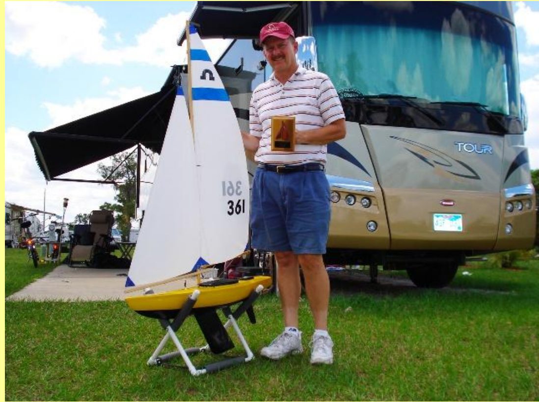
I enjoyed RC Sailboat Racing